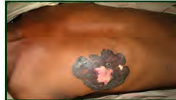
Malignant Melanoma located on a man's chest.

Malignant Melanoma is the most dangerous type of skin cancer in the world. It is not common in The Bahamas. Cases of Malignant Melanoma are increasing worldwide. For instance, in 1989, there were approximately 4,000 cases; by 2008, there were more than 12,666 new cases in the world – approximately 1 in every 10 skin cancers.